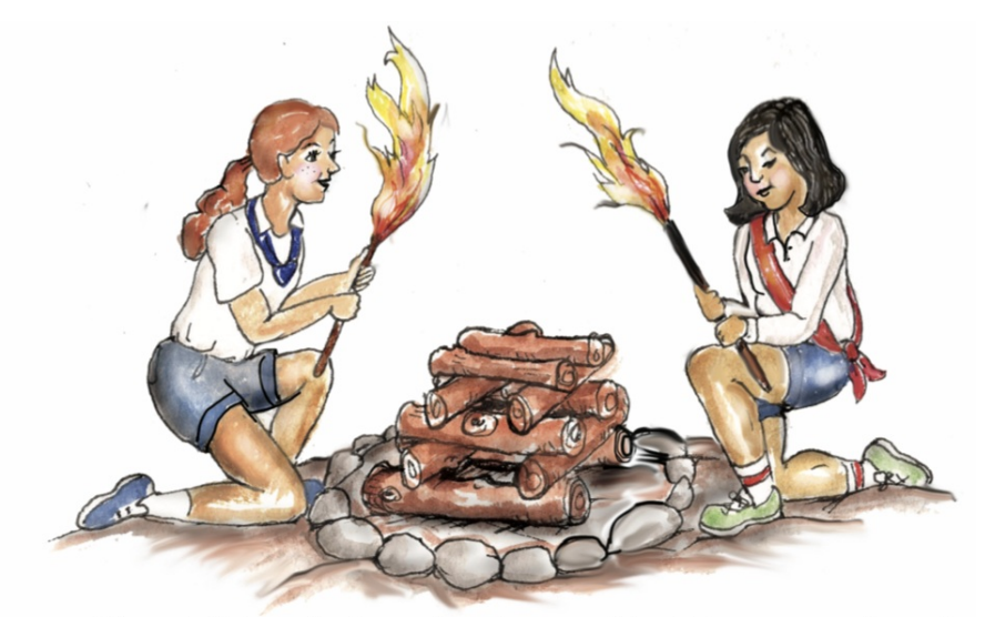
"In each living, glowing ember there are friendships to remember ..."