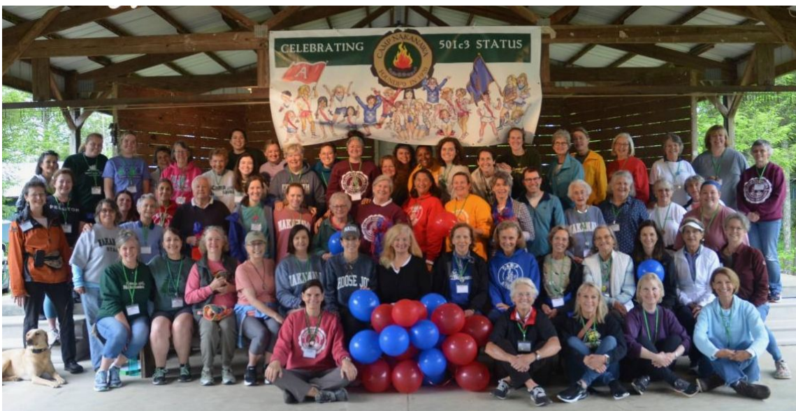
Celebrating our 501(C)(3) status, Service Weekend Style!