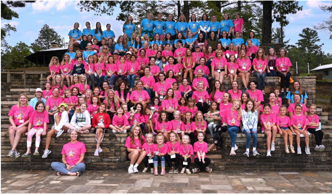
Girls just wanna have fun!

This September 13-15 , help us introduce young ladies to Nakanawa. Ideal for girls ages 5-11, Mother/Daughter weekend is jam-packed with activities for all. Future campers and their chaperones will sleep in a cabin, tour camp, canoe on the lake, ride horses, soar down the zipline, eat s'mores, go on a hayride, learn camp songs, and meet current campers and counselors.