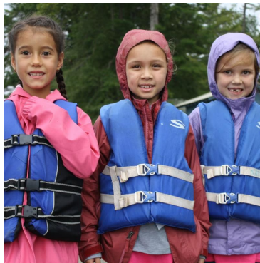
Ready for ANYTHING!