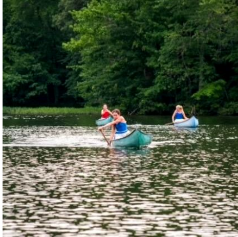
The art of blading is alive and well.

We are incredibly grateful for the Chamberlain Docks, which have already brought so much joy and success to our Camp community. Their addition marks an exciting new chapter for our waterfront activities. We look forward to many more summers of fun and achievement.