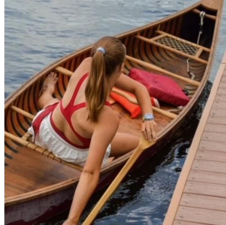
Form is EVERYTHING!