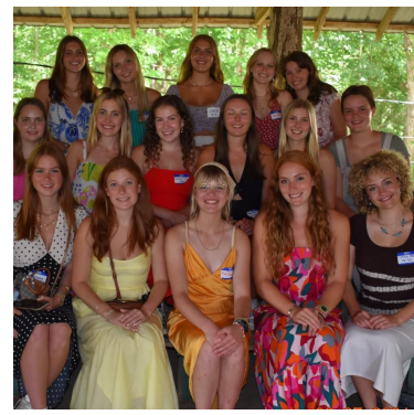
Hey, hey, TR 23! We loved seeing you back at Nakanawa for your one-year reunion.