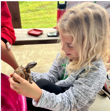
Early introduction to Nature.

This weekend is open to everyone, not just Nakanawa alumnae! Space is limited, so grab your spot to join our fun.