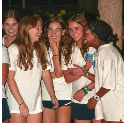
Best of all we loved those laughs.

Post-camp activities of note include our recognition as a Tennessee Centennial Business by the Tennessee Department of Economic & Community Development.