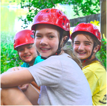
Free Day / Fun Day in Junior Camp.

The final week at Camp was busy as campers competed for distinctions and medals. Performances by the Intermediate/Senior Choir, handbell ensemble, and dance classes were captivating. The Drama class performed "The Cat in the Hat," and Junior Camp's performance of "The Little Mermaid" was the grand finale. It's another Camp miracle that campers can pull all this off in just four weeks.