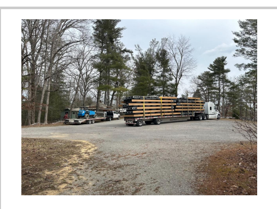
The Chamberlain Dock has arrived!