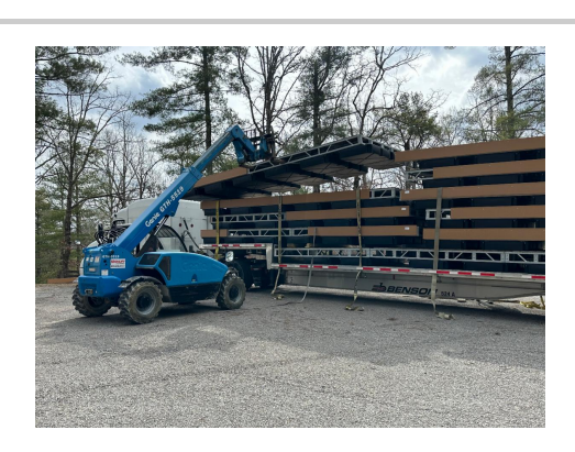
Installment begins soon. Can't wait!

Yes, it's really happening! The Chamberlain Dock and the all-new waterfront are clear examples of the power of our alumnae base. Thanks to your contributions, the future of Nakanawa is bright!