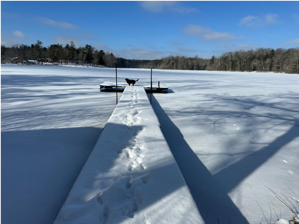
Casey checks out the snowy sailing dock.