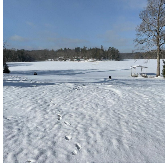
Junior is a short walk by way of Lake Alooa.