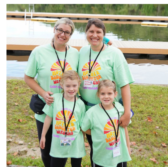
Keeping Camp in the family.

Giving Tuesday is Just Around the Corner