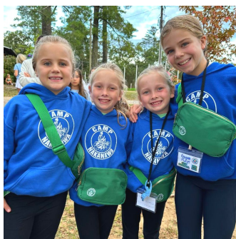
Love that Camp Nak merch!

Top takeaway: The weekend was filled with fun and memorable experiences for campers, their families, and Camp staff.