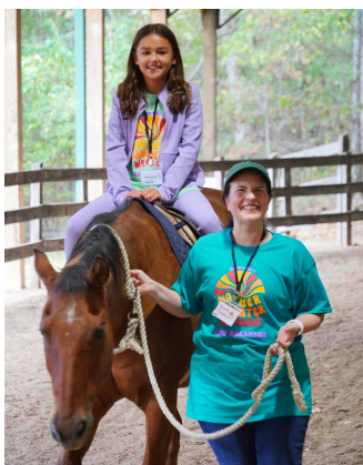
Everyone got to ride!